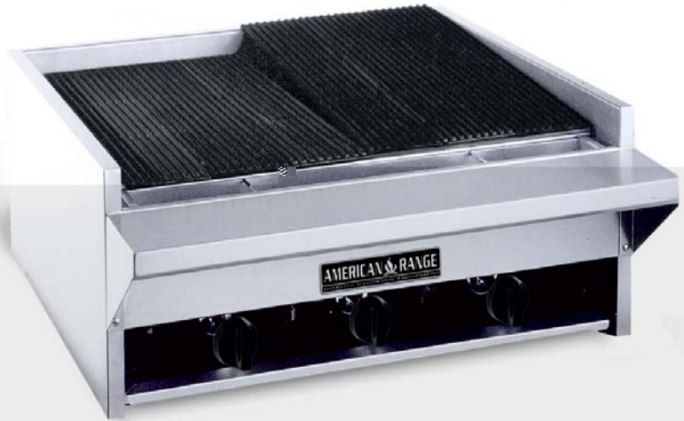
SHOWN WITH OPTIONAL STAINLESS STEEL LANDING LEDGE

All our quality counter appliances come standard with a stainless steel exterior and the best warranty in the business. Look to American Range for innovation, reliable performance, quality and attention to your equipment needs and delivery, now and in the future.