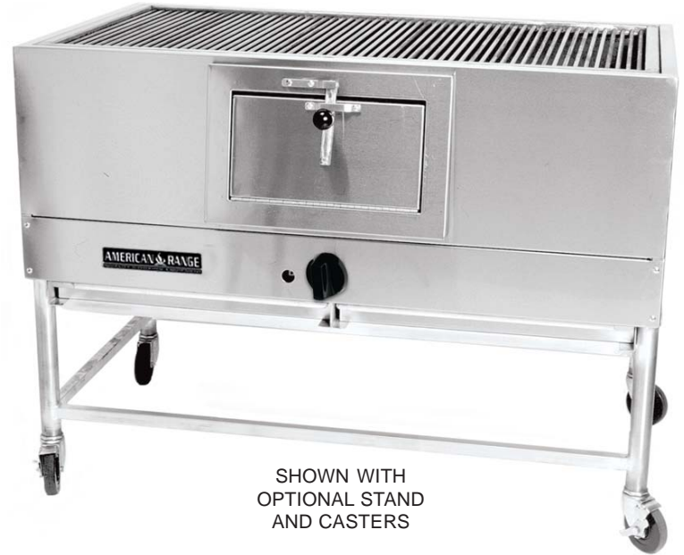
SHOWN WITH OPTIONAL STAND AND CASTERS

American Range provides as standard many of the optional upgrades normally offered at a premium on other Mesquite Wood Broiler lines. The new look features a stainless steel front and sides. Located on the front of the broiler is a large chute for easy loading and moving of wood and charcoal during operation. A built-in gas log lighter eliminates the need for messy lighter fluids or electric starters and can be used during "peak" periods. The American Range Mesquite Wood Broiler enhances the flavor of meat, fish and poultry with the unique flavor of mesquite. The broiler makes mesquite broiling convenient and efficient. The unique open grate bottom allows a continuous updraft of air for optimal fuel combustion saving wood and charcoal costs. The heavy duty cast iron grates make attractive broiling marks to add appetite appeal.